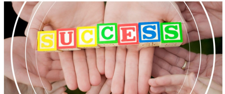
Early Childhood & Elementary